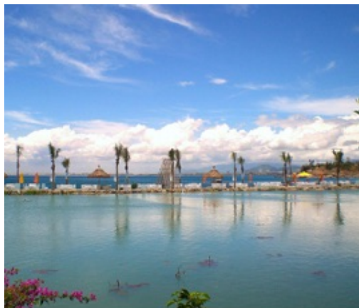
Da Nang (Vietnam)